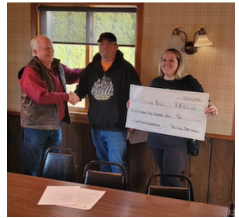
A very special THANK YOU goes out to The Still for holding a bingo event in our honor. They raised $8,400 for our club!